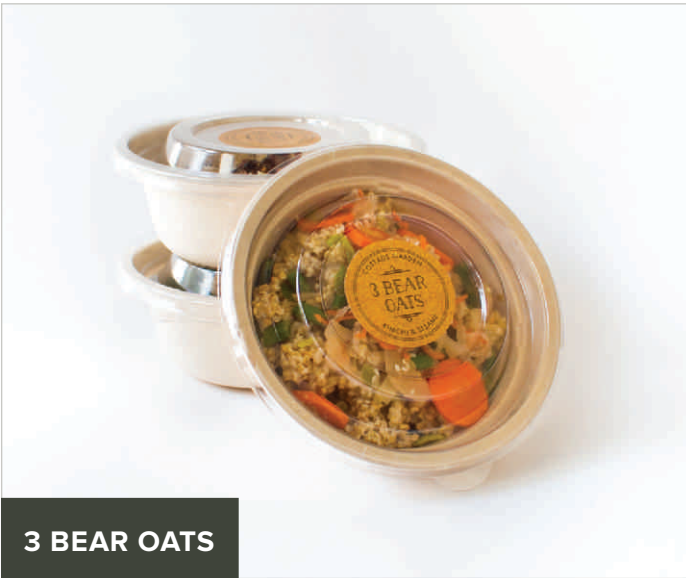
3 BEAR OATS

WATCH THE LAKEWINDS SHELVES FOR THESE FOUR LOCAL PRODUCTS!