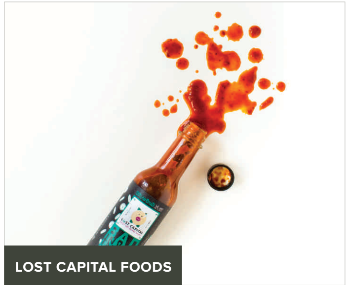
LOST CAPITAL FOODS

These sweet and savory organic steel-cut oatmeal bowls are food for the heart. But Therese of 3 Bear Oats wanted more options for her Farmers Market customer base. With local ingredients and elevated flavor profiles, her ready-to-heat frozen grain bowls serve up a hearty helping of the Heartland.