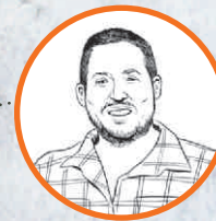
THE PHILLY SQUARED