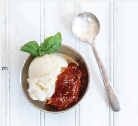
balsamic tomato compote with vanilla ice cream