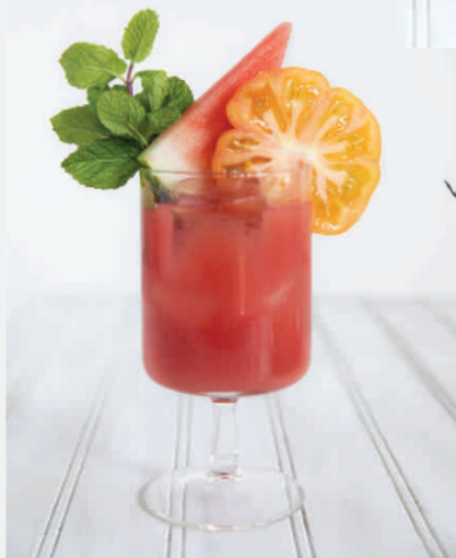
watermelon tomato agua fresca

Get these and other summer recipes at lakewinds.coop/recipes