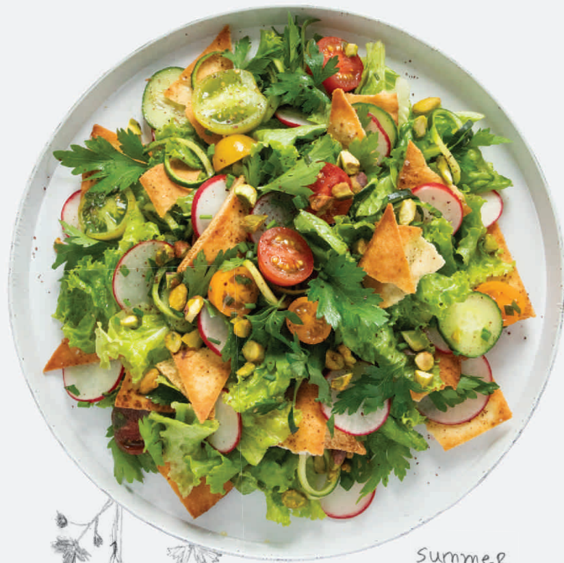
Summer Fattoush salad