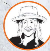
THE RANCH RODEO

Go bunless! This kale Sriracha beef brat has a rich and spicy flavor that pairs well with a fresh Brussels sprout salad and a lime honey vinaigrette.