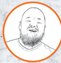
THE BRUSSEL HUSTLE

Let's be frank. Lakewinds' house-made sausages are the perfect vehicle for all of your favorite condiments and garnishes. But why let ketchup and mustard hog the spotlight? We've asked some of our favorite Twin Cities food personalities to beautify our brats with their own awesome additions. The results are Dog Heaven.