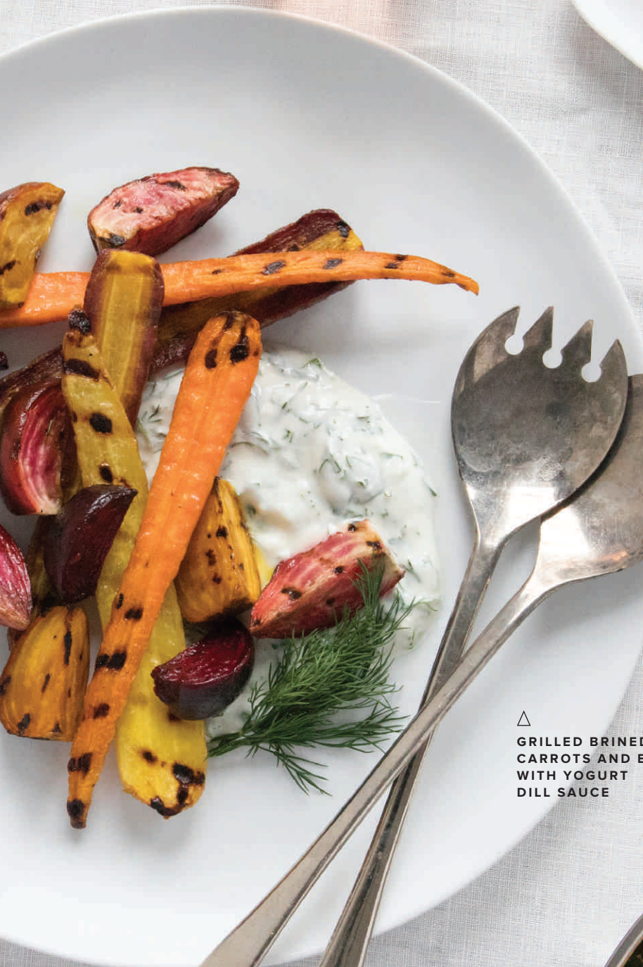
△ GRILLED BRINED CARROTS AND BEETS WITH YOGURT DILL SAUCE