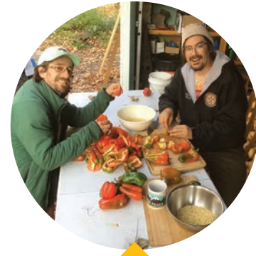
North Circle Seeds