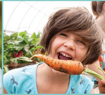
Women's Environmental Institute