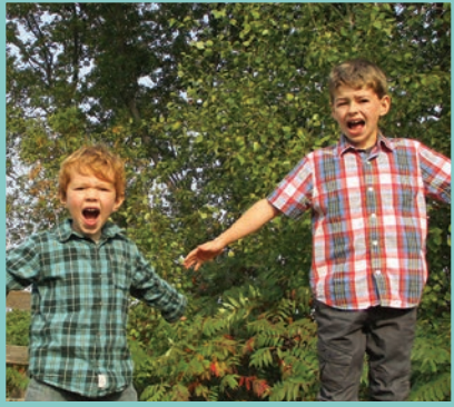
Fox & Fawn Farm