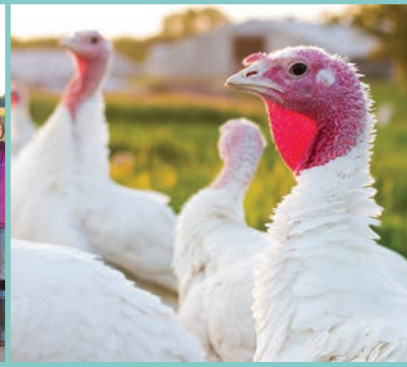
Ferndale Farm & Market