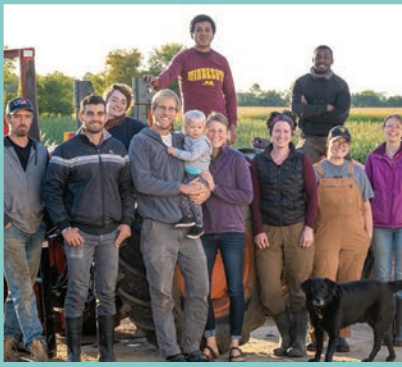
Sogn Valley Farm