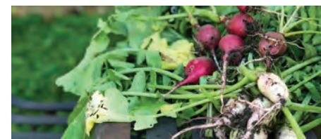
Every Meal's Grow & Give

All of the roughly 450 students at Bluff Creek Elementary helped plant or tend the school's garden throughout the season.