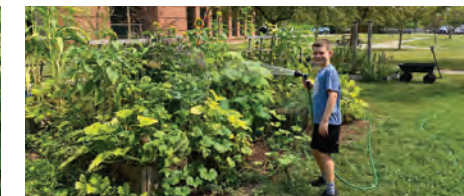
Bluff Creek Elementary

The garden at Hope House (Open Hands) grew 2,350 lbs. of produce and donated 40+ bouquets of flowers to nursing homes and senior centers.