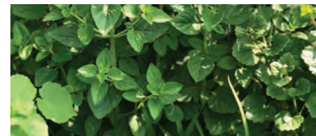
Hope House (Open Hands)

Here are some highlights from last summer's growing season: